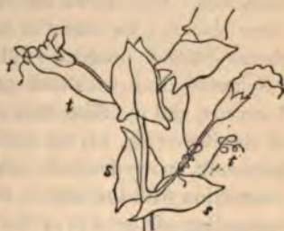
Fig. 10. YELLOW VETCH.